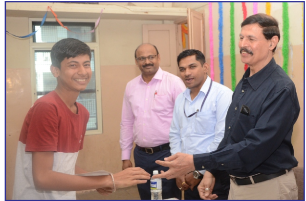
1 st Prize In Technical Quiz Competition