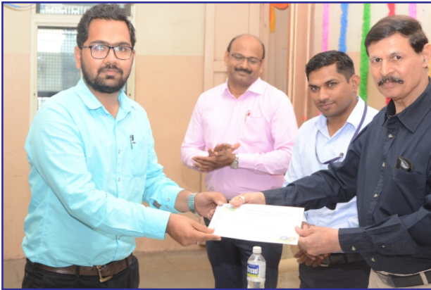
1 st Prize In Graphic Design and Extempore Competition