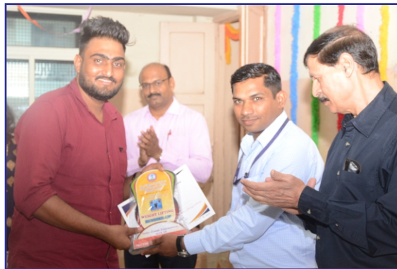
Runner Up in Weight Lifting